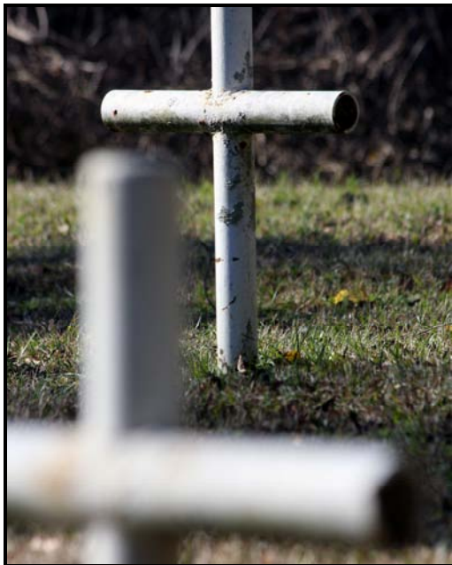
Figure 7: Present Day Crosses