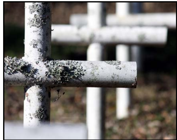
Figure 6: Present Day Crosses