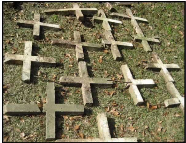
Figure 4: Discarded Crosses