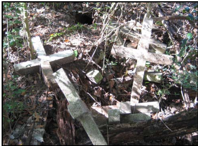
Figure 5: Discarded Crosses

During the course of inspecting the cemetery location, FDLE searched the wooded area north of the site and found two separate areas where remnants of several discarded concrete crosses were found. These crosses were located approximately 30 yards north of the cemetery and approximately 20 yards from each other. Both sets of discarded crosses were located at or near the base of large trees. Although heavily damaged and broken, both sets of crosses were fortified with rebar. The crosses measured 48" tall and had an 18" cross beam. It was determined that the crosses had at one time been painted white. The crosses appeared to have been undisturbed for quite some time and were not noticeable from the roadway due to heavy brush and vines. There were no obvious trails showing any type of recent activity in the area. The crosses were photographed at their locations and left undisturbed until their removal on December 18, 2008.