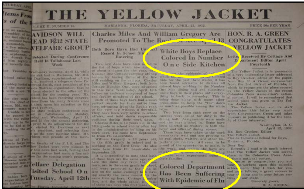
Figure 11: Example of the School's Newspaper

Except as noted, the remaining deaths listed are largely accidental or medically related: