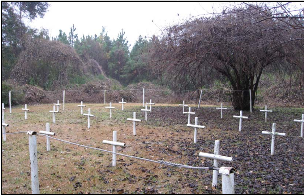
Figure 3: Photo of the School's Cemetery

The School’s Cemetery is positioned in a small field approximately a quarter of a mile north northwest of the Jackson County Corrections Facility located at 2737 Pennsylvania Avenue, Marianna, Florida. The Global Positioning System (GPS) coordinates for the School Cemetery are 30° 45’ 59”N 85° 15’ 43”W, situated in Jackson County Township Range 4N-10W. The property is owned by the State of Florida Board of Trustees of the Internal Improvement Trust Fund and directly leased to the Florida Department of Health. The Department of Health has subleased the property to the Florida Department of Corrections (Lease # 2771). (See Figure 3)