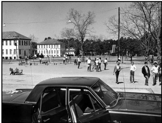
Figure 2: Playground and buildings at the Boys School